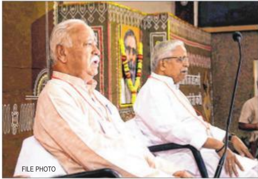
Ram temple in Ayodhya. The VHP may organise a programme in coming days so that the construc-

A proposal for building Ram temple is being put up at the meeting. The members discussed how the issue can be connected with the society after the foundation-laying ceremony of