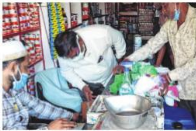
A large quantity of non-standard polythene was seized by the municipal corporation team in the city recently. Businessmen were fined Rs 2,500 when found using non-standard polythene.

The challan action of Rs 700 on C&D waste was done by the team of the corporation under the direction of Municipal Commissioner Vishal Singh Chauhan. Zonal in-charges checked garbage vehicles and urged people to throw wet and dry waste separately. The commissioner has appealed to the citizens of the city to come out of their homes wearing masks and to maintain social distance in view of the infection of Covid-19.