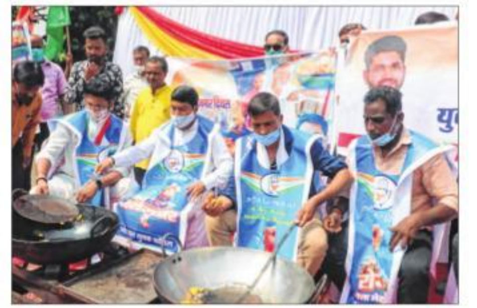
Congressmen fry pakoras at MPPCC raising issue of unemployment on birthday of PM Narendra Modi on Thursday

Choudhary said country's youth feel cheated in the name of employment. "Crores of youths are